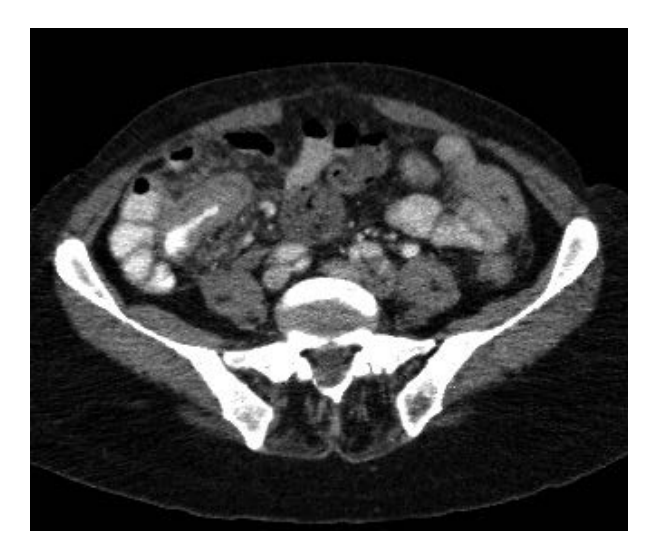
Figure 2. Abdominal CT showing wall thickening of the distal ileum

Five anti-TNF-alpha drugs are currently in clinical use. They have structural differences and, thus, their therapeutic indications differ (6,7) (table 1).